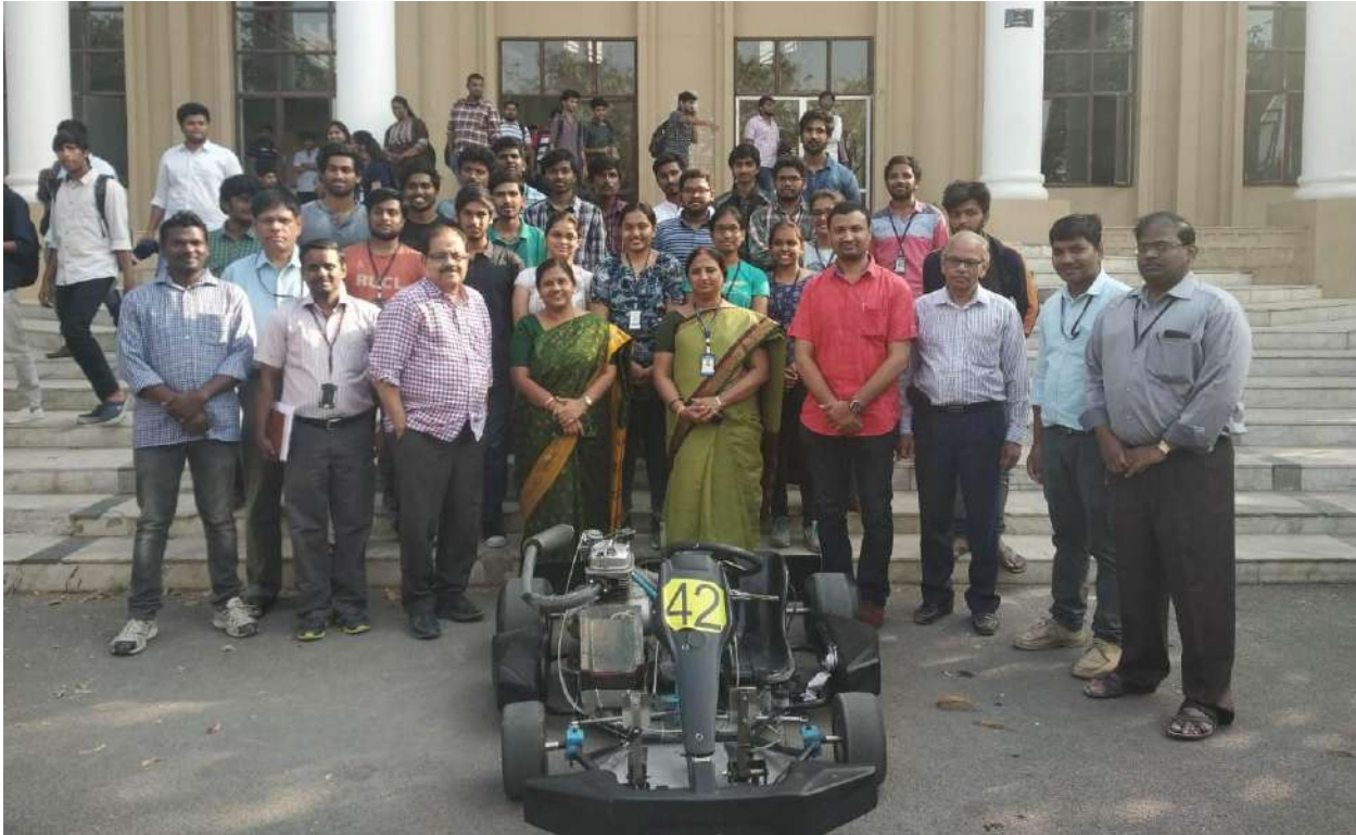
The Team before the start of Journey