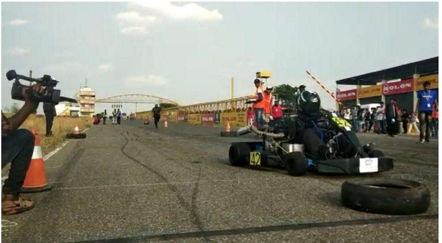
Technical Inspection: Dynamic Testing