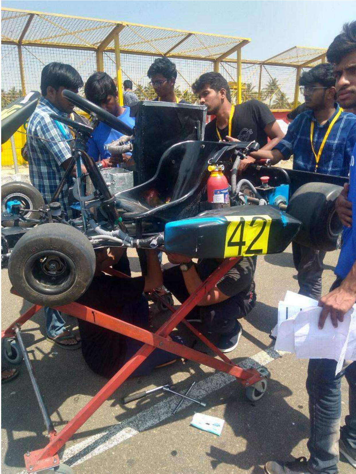
Technical Inspection: Static Testing