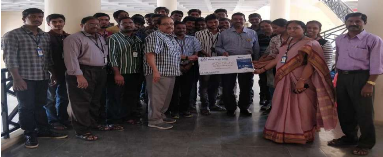
Best Engineering Design Award Team being receive by the Team from Secretary, MES, Principal, Vice Principal & Coordinators