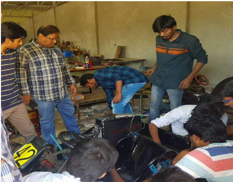
Team Efforts during Final stage