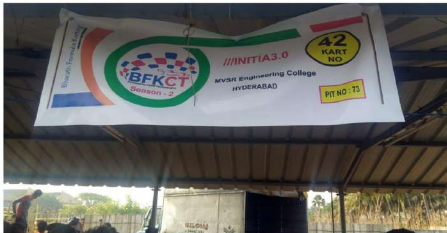
At Bharath Formula Karting, Coimbatore