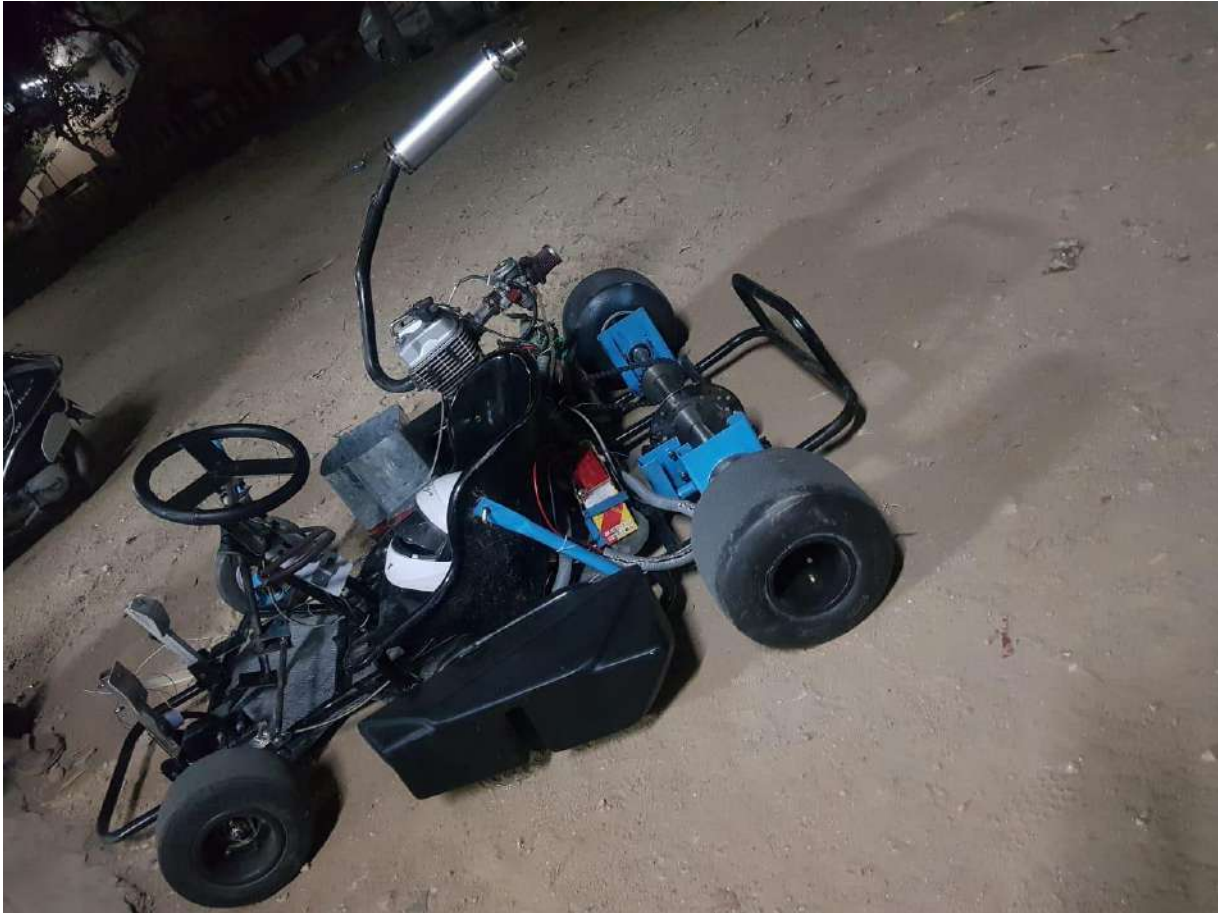
The completed Vehicle: ///Initia 3.0