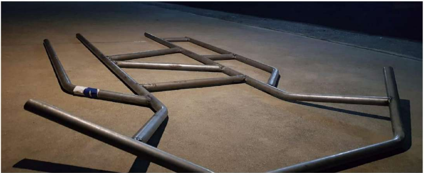
Start of Fabrication