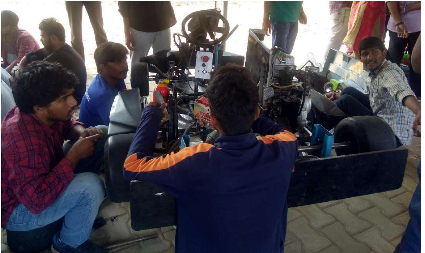
Team Initia @ Pit