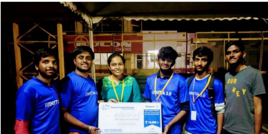
Best Engineering Design Award to the Team ///Initia 3.0