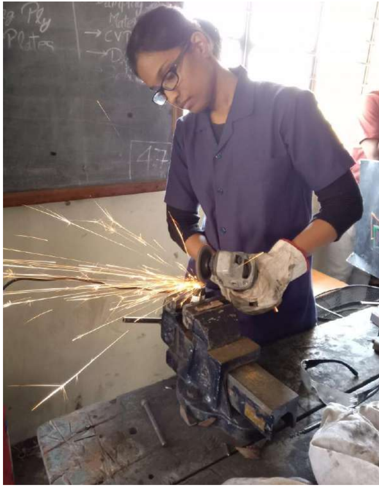
Fabrication in Process