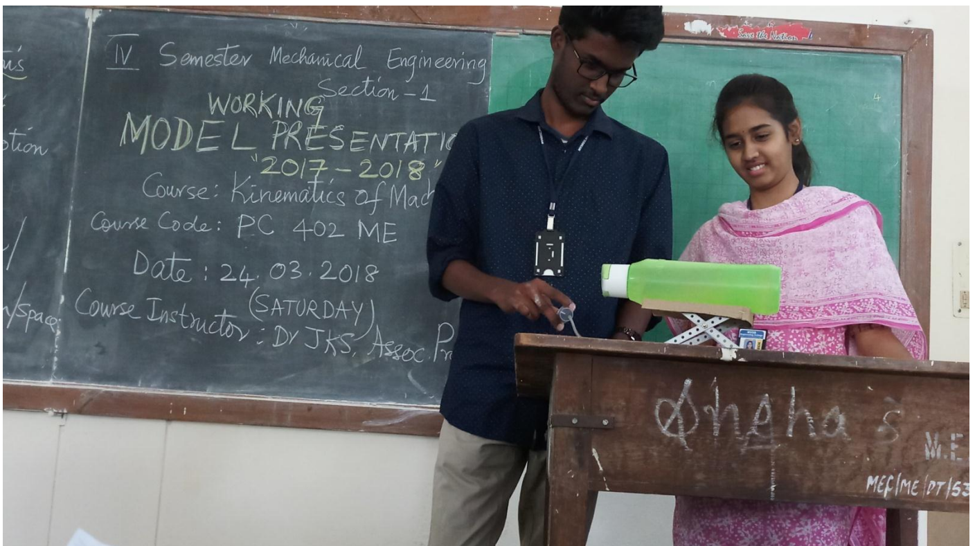
Hydraulic Weight Lifter

2451- 16-736-304 B Shiva 2451- 16-736-311 S Manaswini