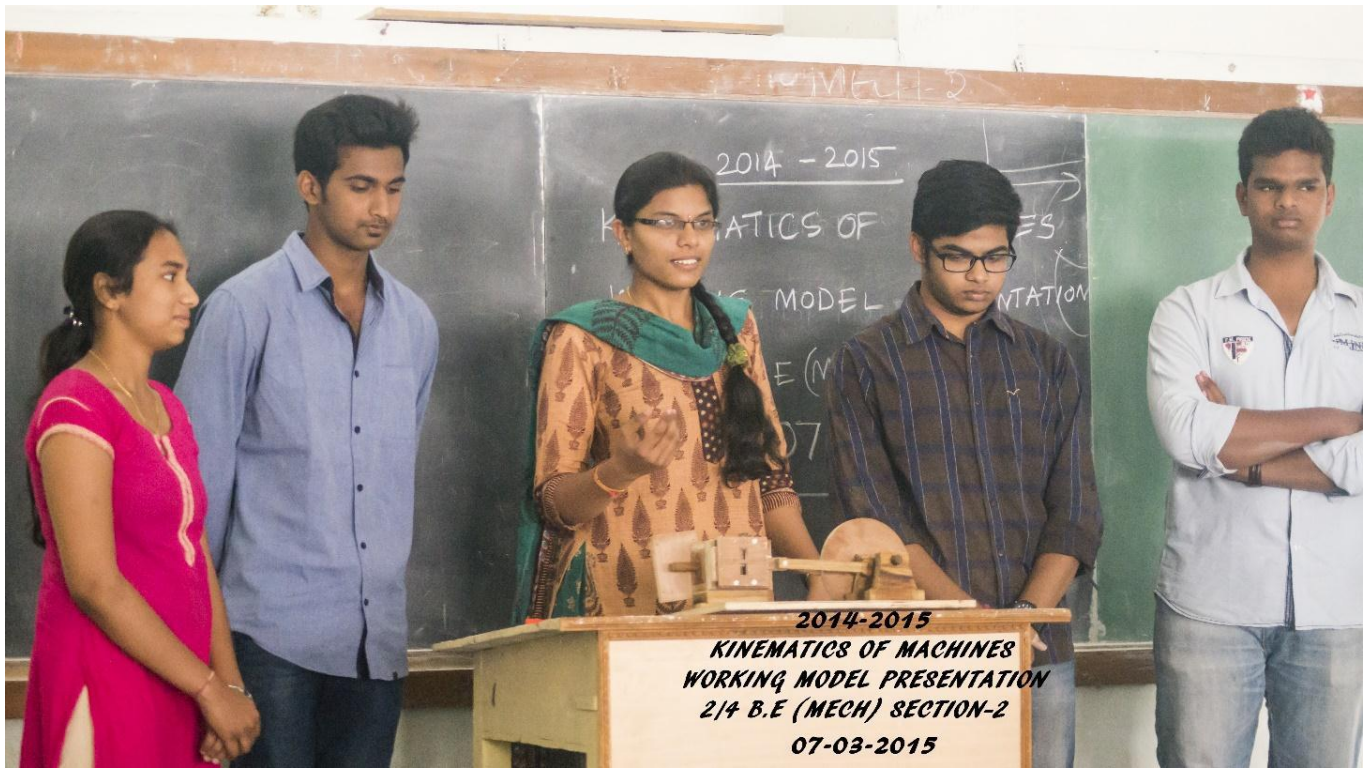
2014-2015 KINEMATICS OF MACHINES WORKING MODEL PRESENTATION 2/4 B.E (MECH) SECTION-2 07-03-2015