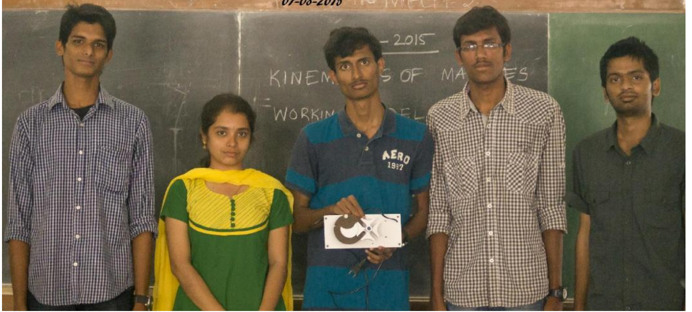
2014-2015 KINAMATICS OF MACHINES WORKING MODEL PRESENTATION 2/4 B.E (MECH) SECTION-2 07-03-2015