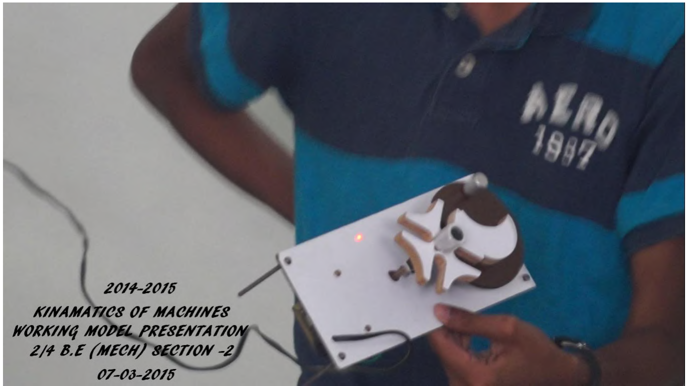
2014-2015 KINAMATICS OF MACHINES WORKING MODEL PRESENTATION 2/4 B.E (MECH) SECTION -2 07-03-2015