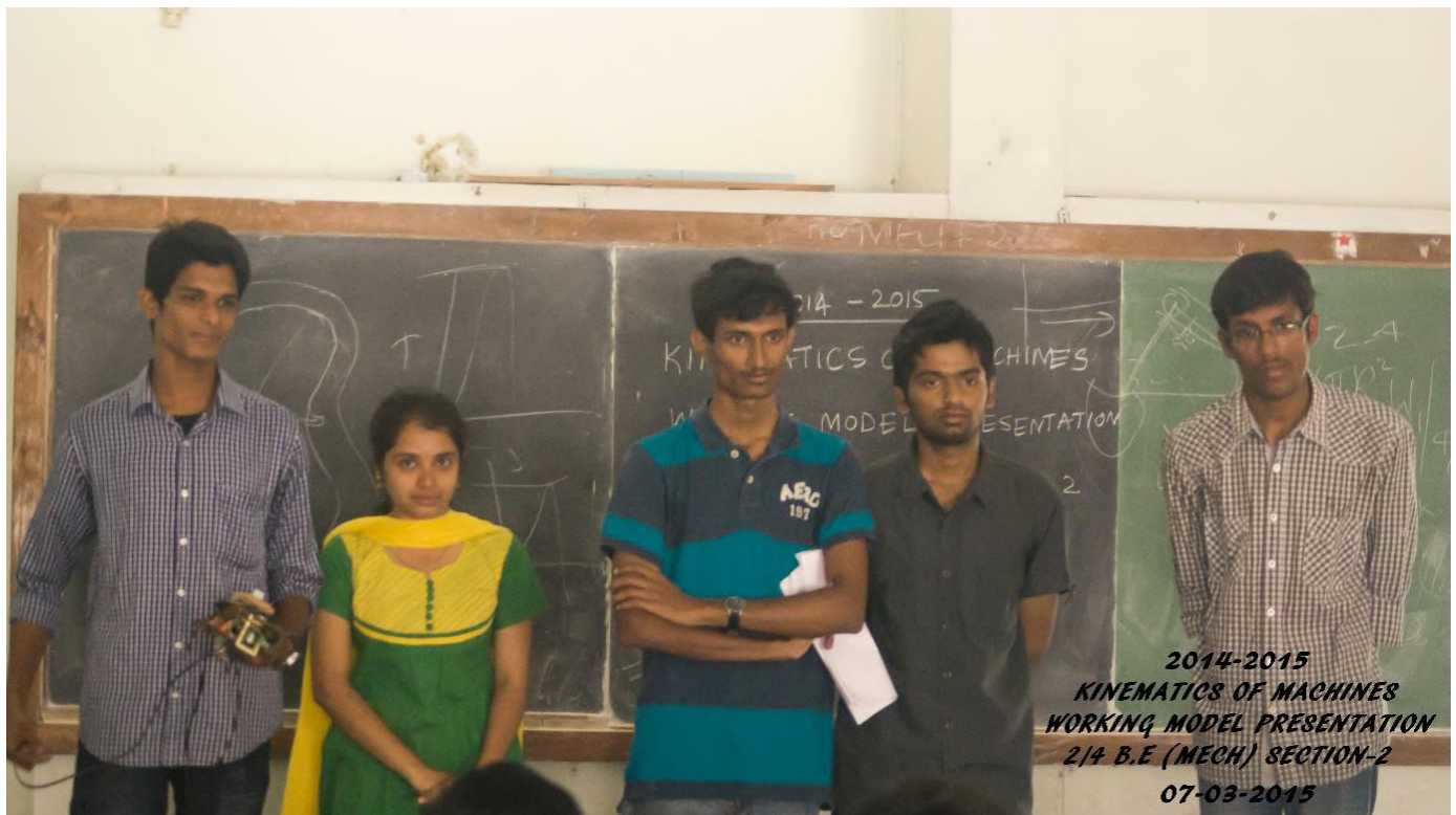
2014-2015 KINAMATICS OF MACHINES WORKING MODEL PRESENTATION 2/4 B.E (MECH) SECTION-2 07-03-2015