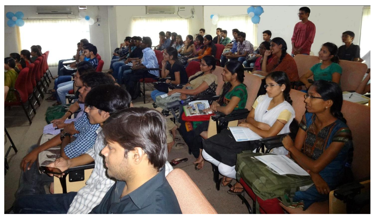
A Snapshot of the Students who attended the Function.