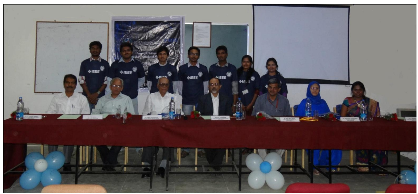
IEEE Core Team with all the Guests.